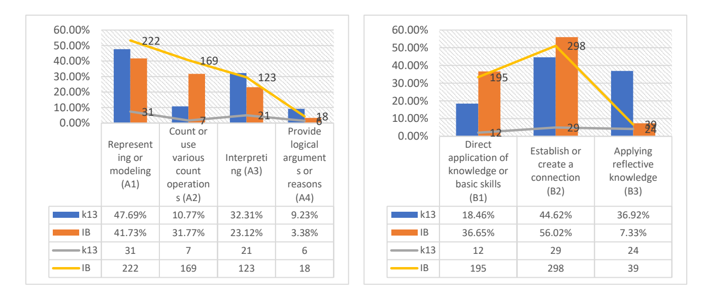
Figure 1. Percentage of Mathematical Activity Dimensions (A) and Question Complexity (B).

Based on the type of answer (C), the two mathematics textbooks analyzed were still very focused on the type of questions with closed answers (C1) which accounted for more than 85% of the number of questions analyzed. Whereas the type of questions with open answers (C2) in the mathematics textbook in the 2013 curriculum was only 8 questions or 12.31% of the total questions and in the mathematics textbook in the IB